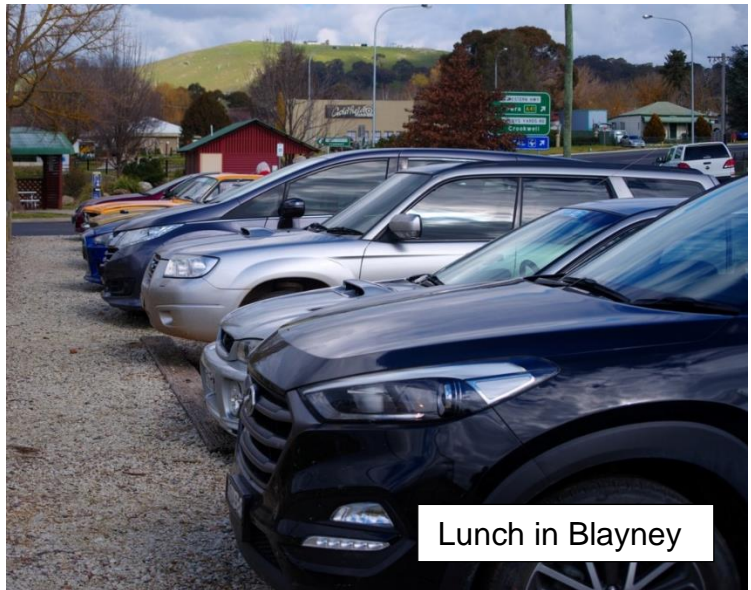
Lunch in Blayney

In the Darkness the triangle waits to condemn you to history in your Perky little four valves or fire belching turbos. It is only the best that return from the triangle.