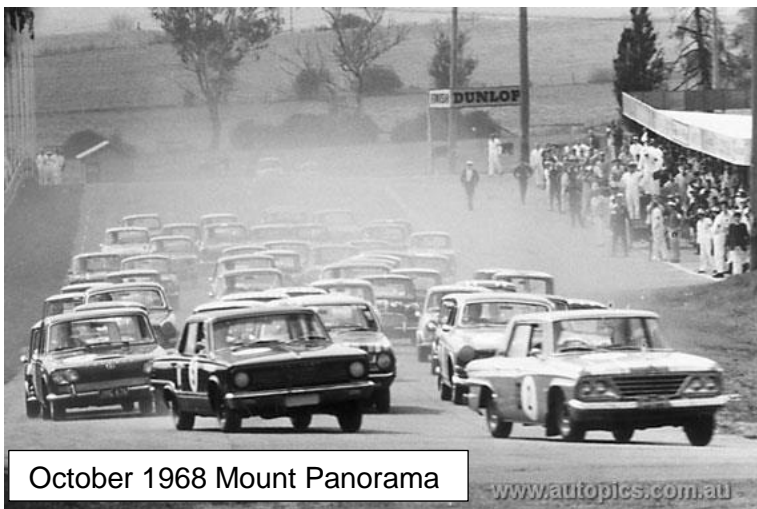
October 1968 Mount Panorama

gained sole rights to run the Beer Booths at the Easter Race meetings on the Mount. In return for these rights Club members built several brick beer booths and fund raising became a thing of the past. In 1969 CAMS advised that all Road events were banned so members sought other means such as Hillclimbs and Motorkhanas to get their thrills.