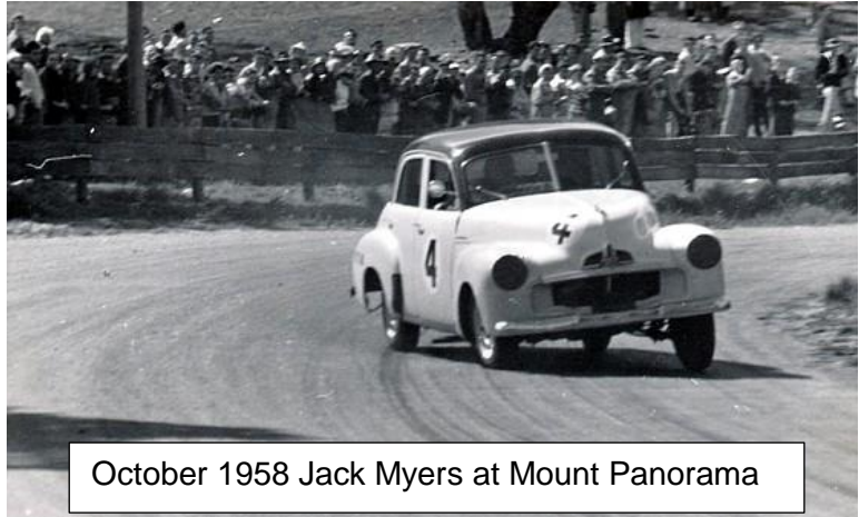
October 1958 Jack Myers at Mount Panorama

Club members constructed much of the original timber fencing around the Mount and then later the tyre barriers that preceded the current concrete barriers.