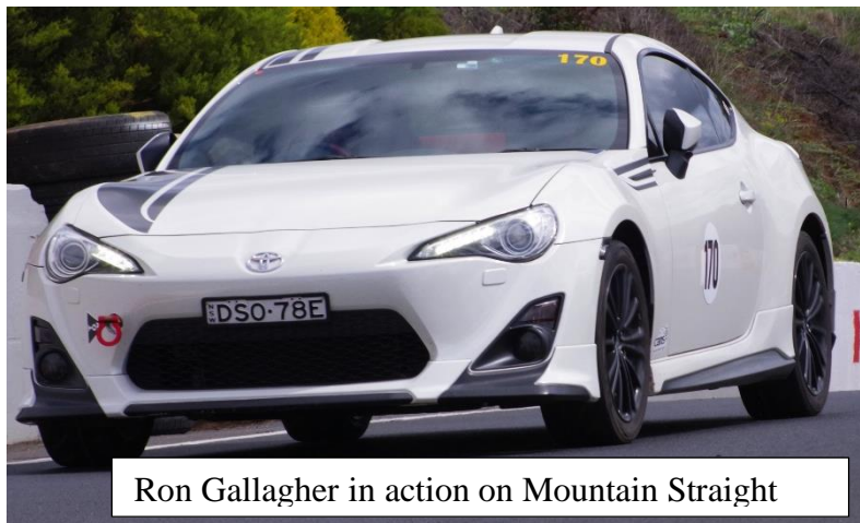
Ron Gallagher in action on Mountain Straight