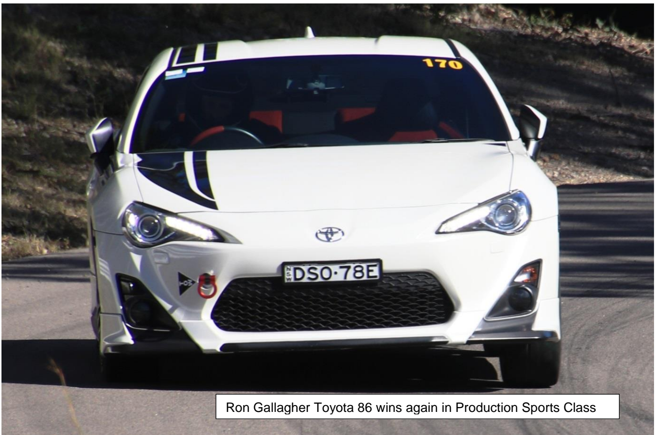
Ron Gallagher Toyota 86 wins again in Production Sports Class