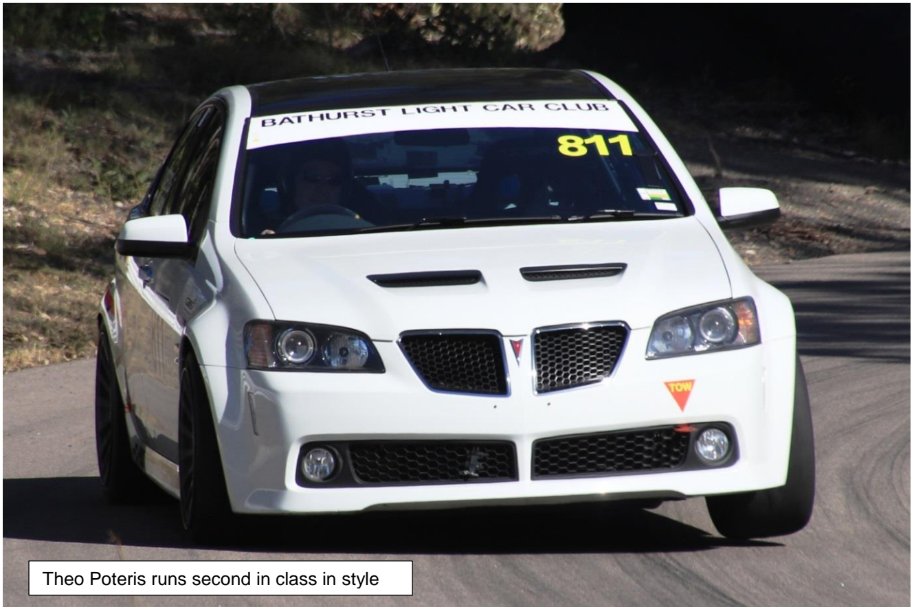
Theo Poteris runs second in class in style