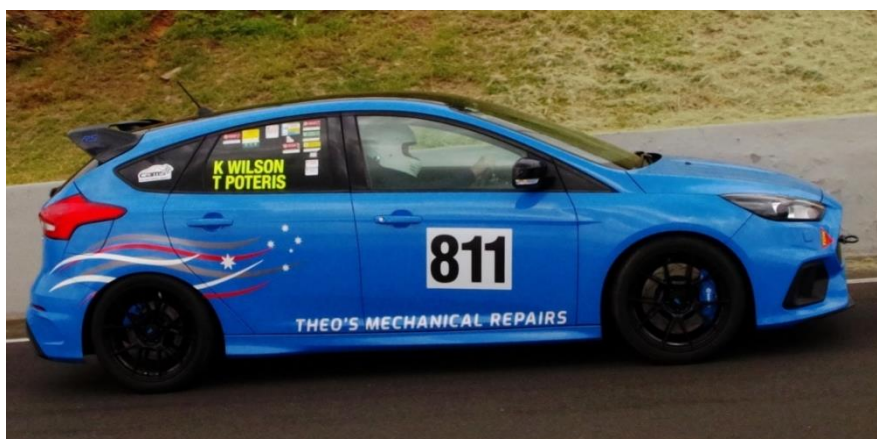
Theo Poteris - 3 rd Esses Road Registered AWD – Ford Focus