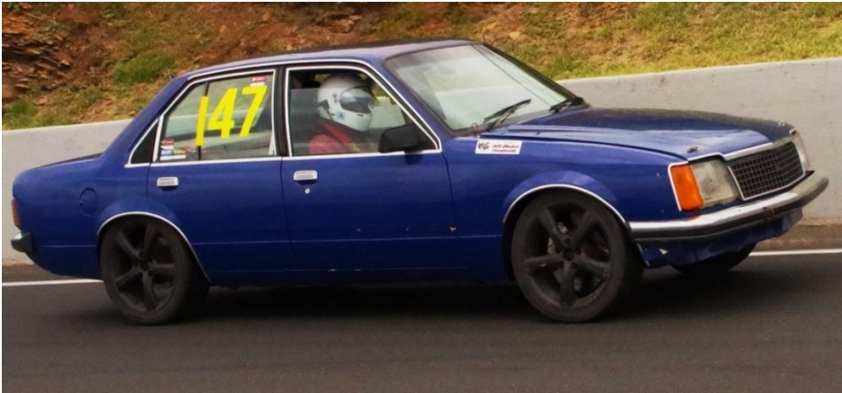
Mal Pollard Commodore – 3J Improved Production over 3000