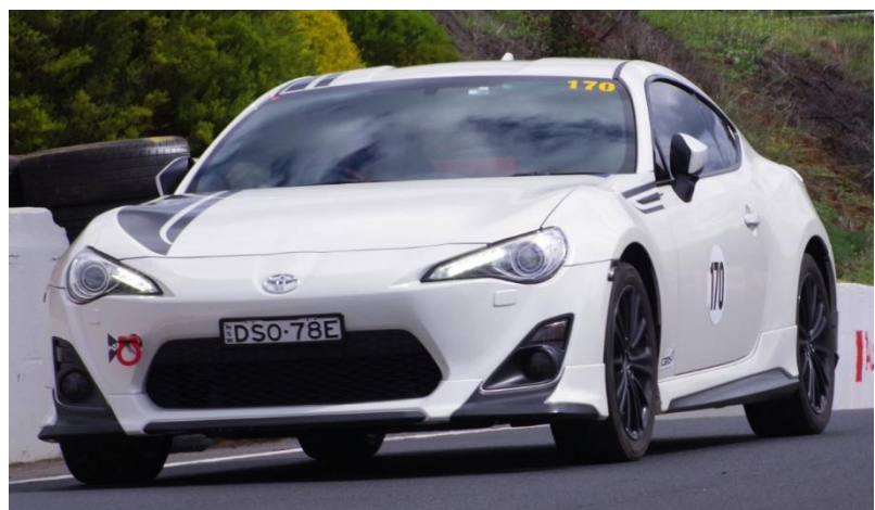
Ron Gallagher Toyota 86 – Esses 1 st 2F Production Sports over 1600