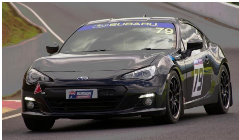
Shannon Maher Subaru BRZ – 3 rd Mountain Straight Road Registered over 2500