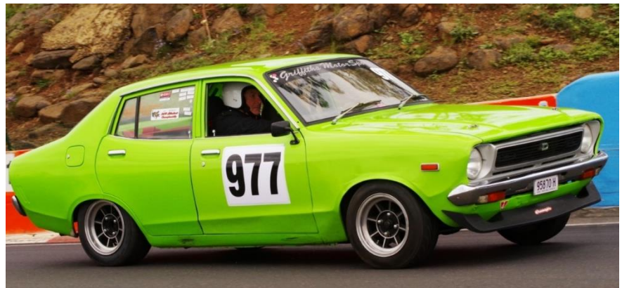
Steven Griffiths Datsun 120Y – Road Registered under 2500