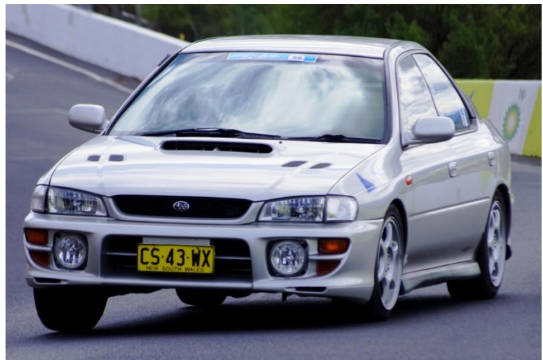
Kyle Curry Subaru WRX – Road Registered All Wheel Drive