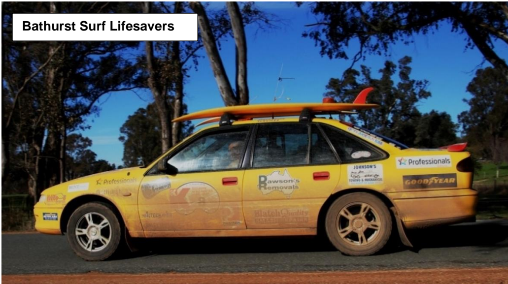
Bathurst Surf Lifesavers