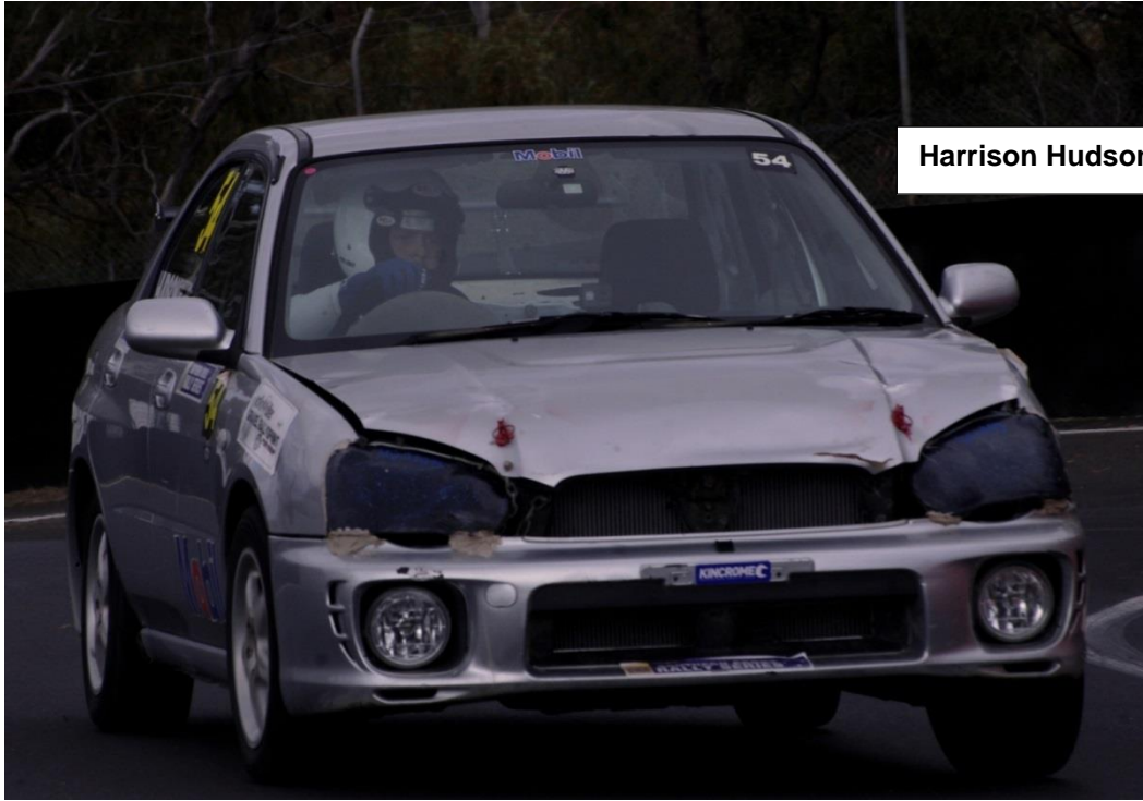
Harrison Hudson one of four juniors