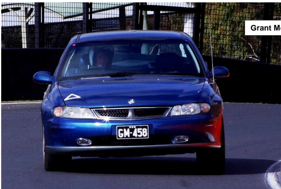
Grant Moiler for the class win