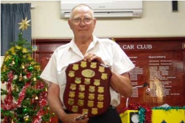
Officials, Competitors and Friends enjoying the 2015 Christmas Party & Presentation Night.