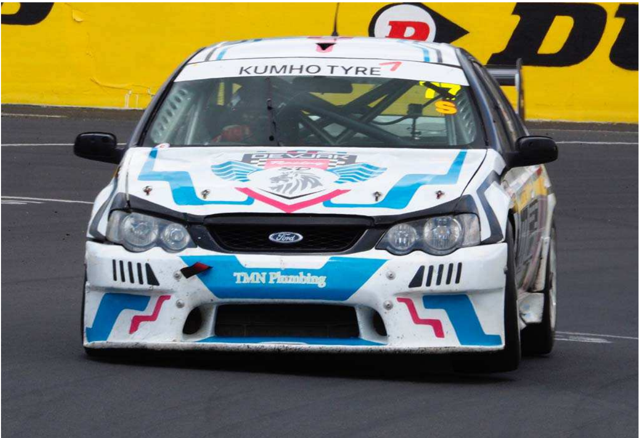
Doug Barry finished the Speed weekend as fastest over the 2 days