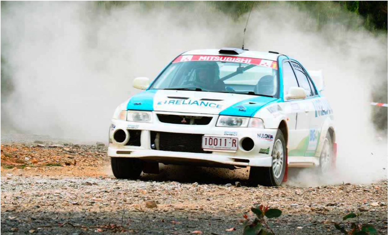
Ron and Jo Moore were out after succumbing to wildlife damage