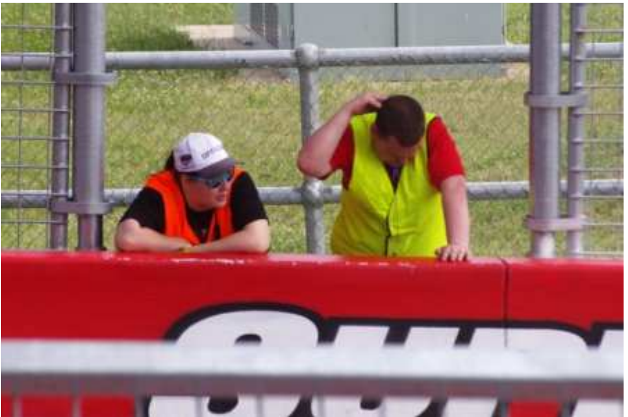
Calm before the storm. BLCC officials at the finish line