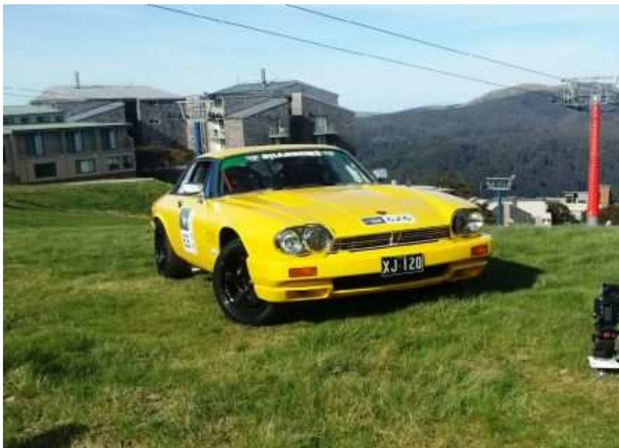
The Jag preparing for media commitments at Targa High Country.