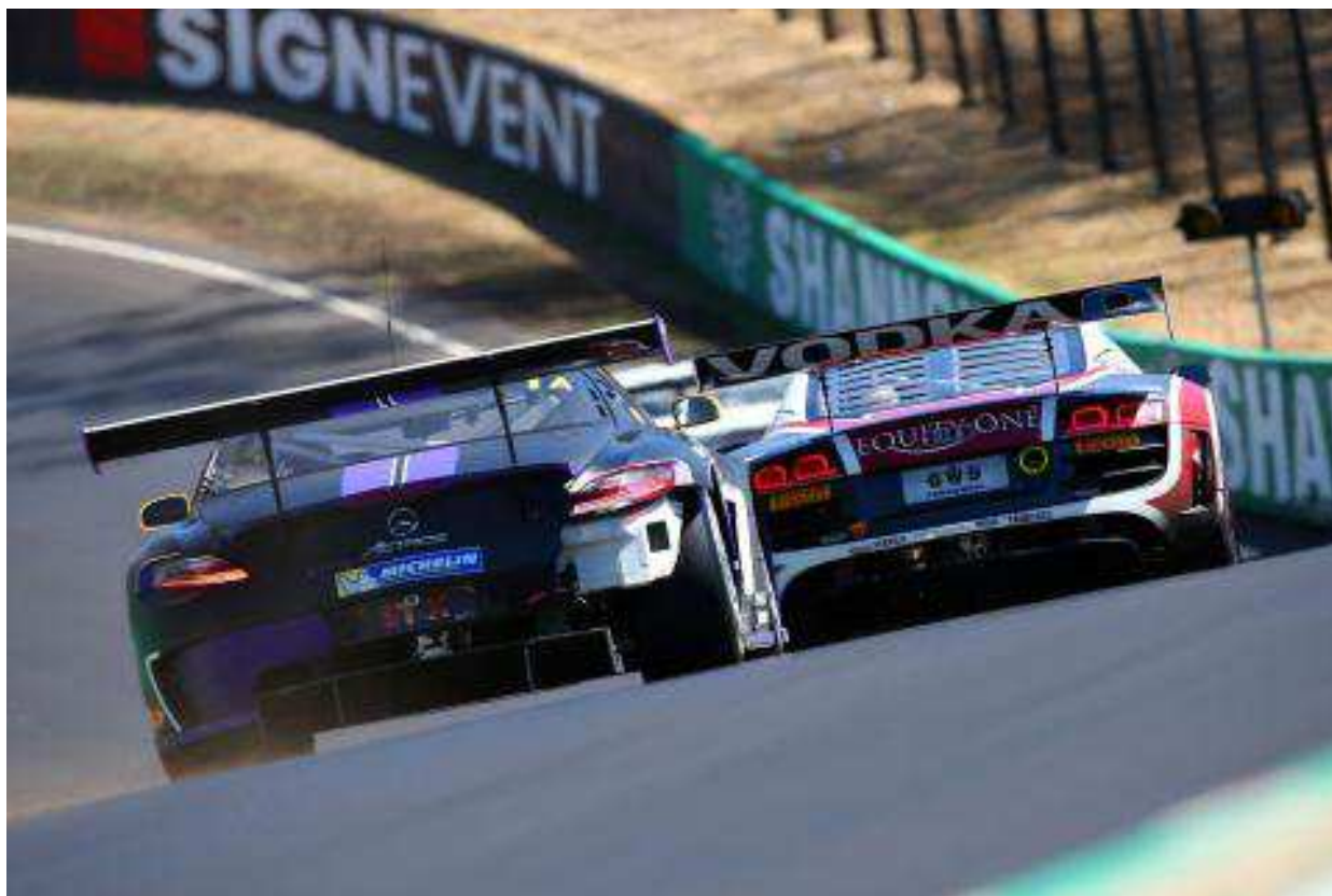
Heading for the grate