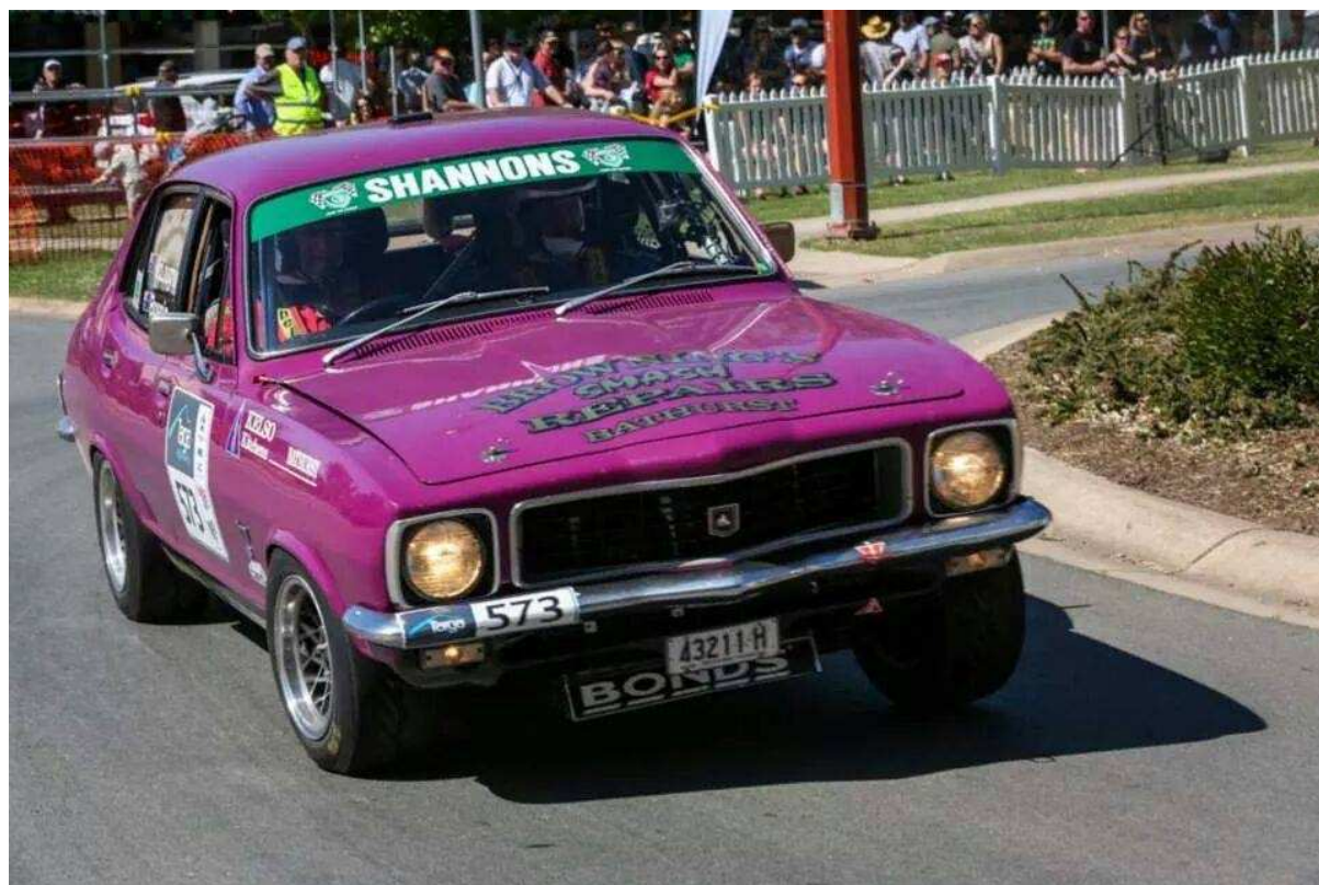
Martin and Warren 6th in Late Classic and 10th in classic outright

The 3 day Targa High Country event was based at Mt Buller in the Victorian High Country and saw two crews from Bathurst Light Car club competing with mixed results.