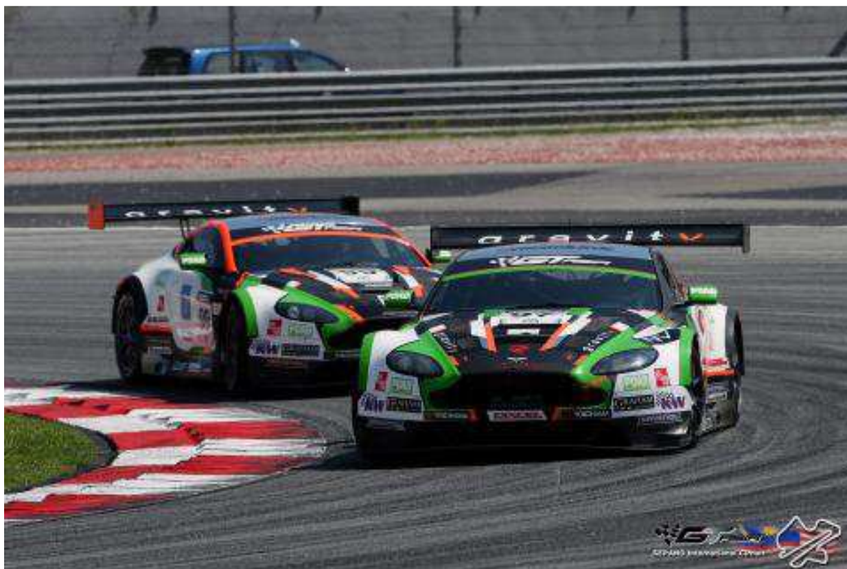
Craft Bamboo Racing will enter a two-car Aston Martin assault

With entries still coming it may be time to start planning a social event at the car clubrooms now we have a sealed road (back access) to our car park. Take in the pits and other vantage points around and then visit the club for a bite to eat and a quite drink.