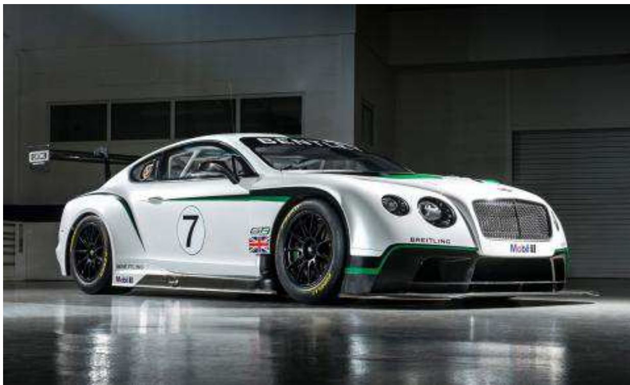
Bentley look the works