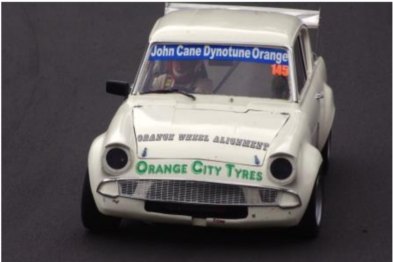
Gwyn Mulholland 2 class wins