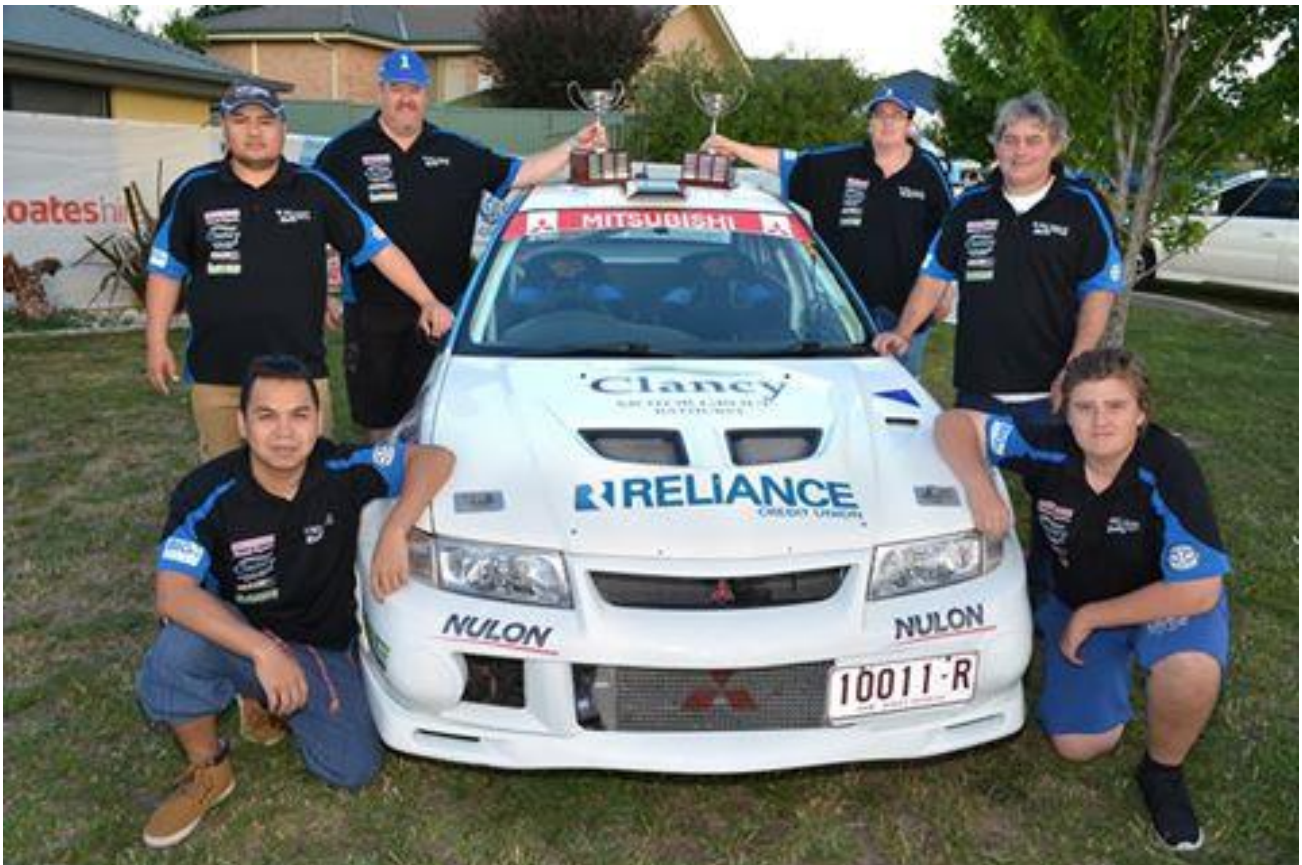
The victorious 2016 Reliance Bank Rally Team

BATHURST LIGHT CAR CLUB 416 CONROD STRAIGHT MT PANORAMA PO BOX 444 BATHURST www.blcc.com.au