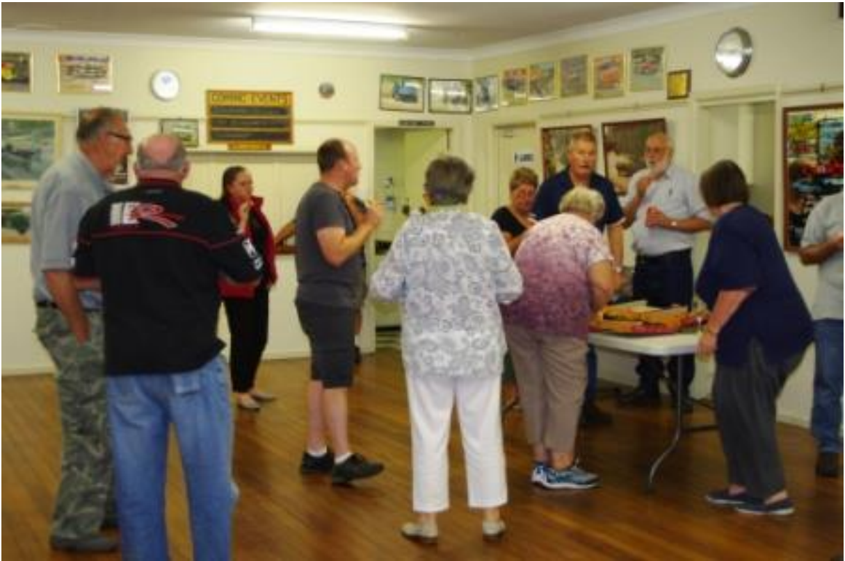
Members and friends enjoying pizza after finishing the trial