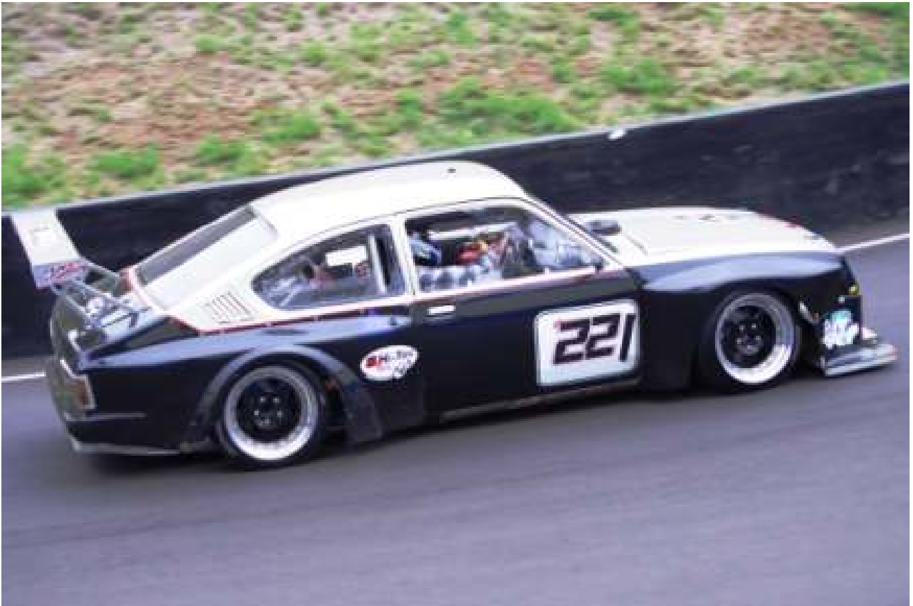
Greg Frame finished the weekend with two 2 nd in class