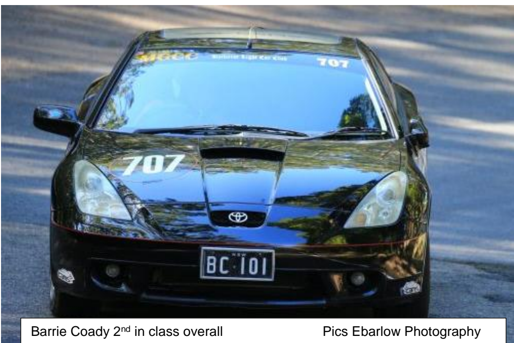
Barrie Coady 2 nd in class overall