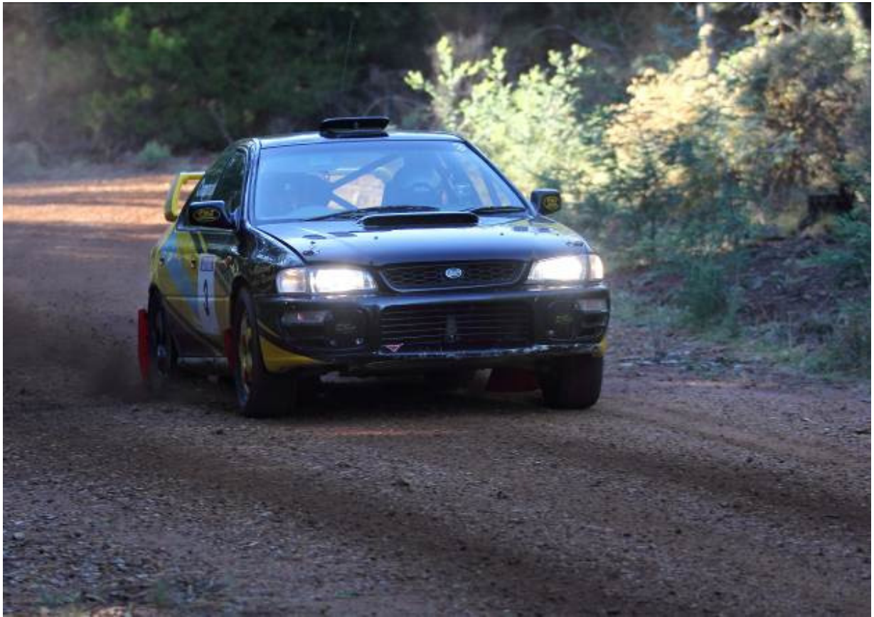
Joe Chapman/Greg Westman on their way to victory at Orange