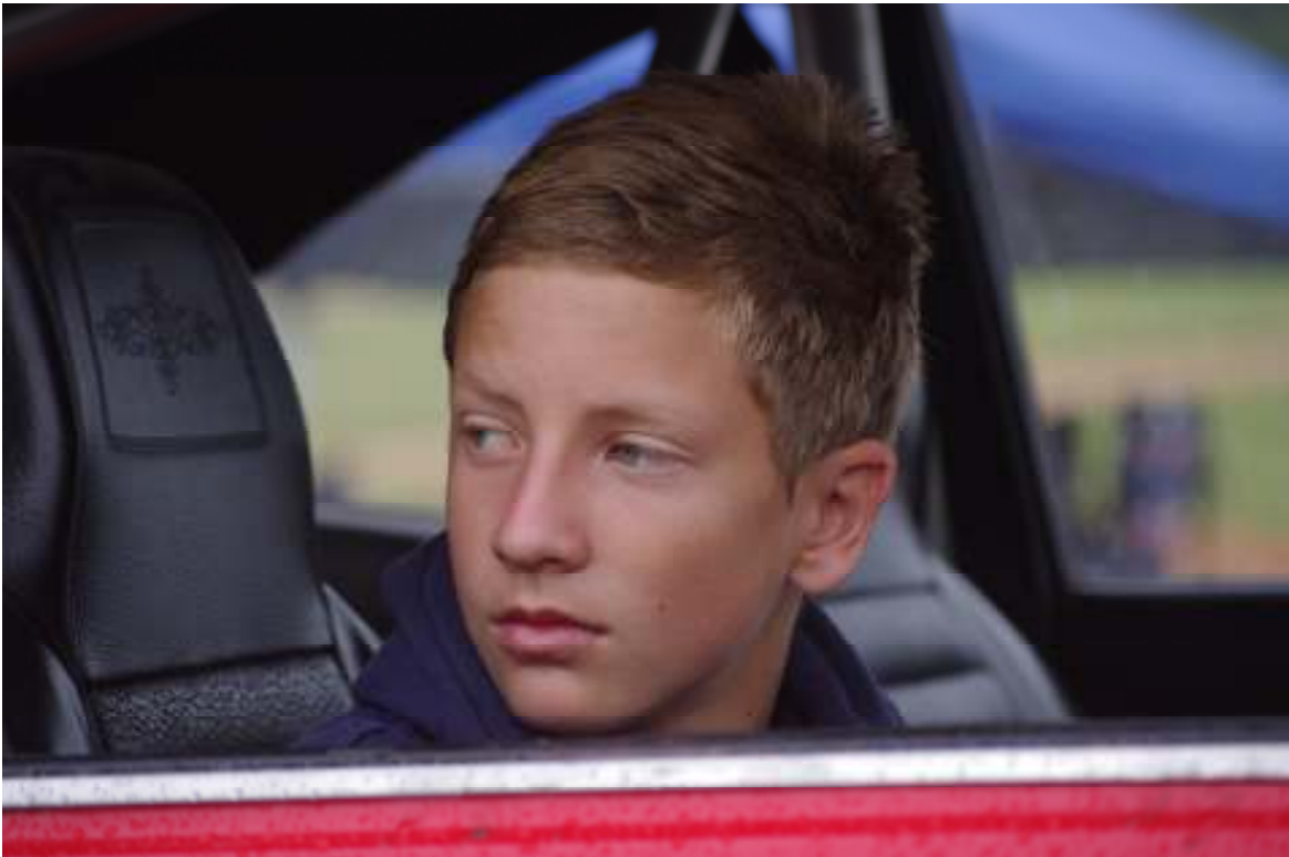
Youth, our next 60 years