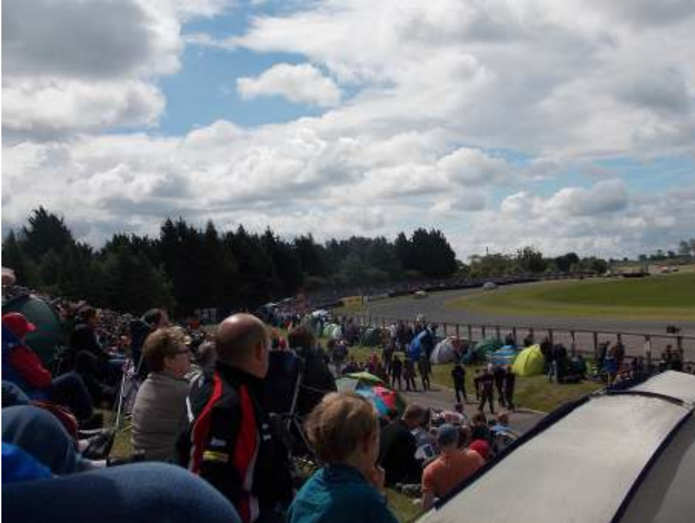
Part of the multitude