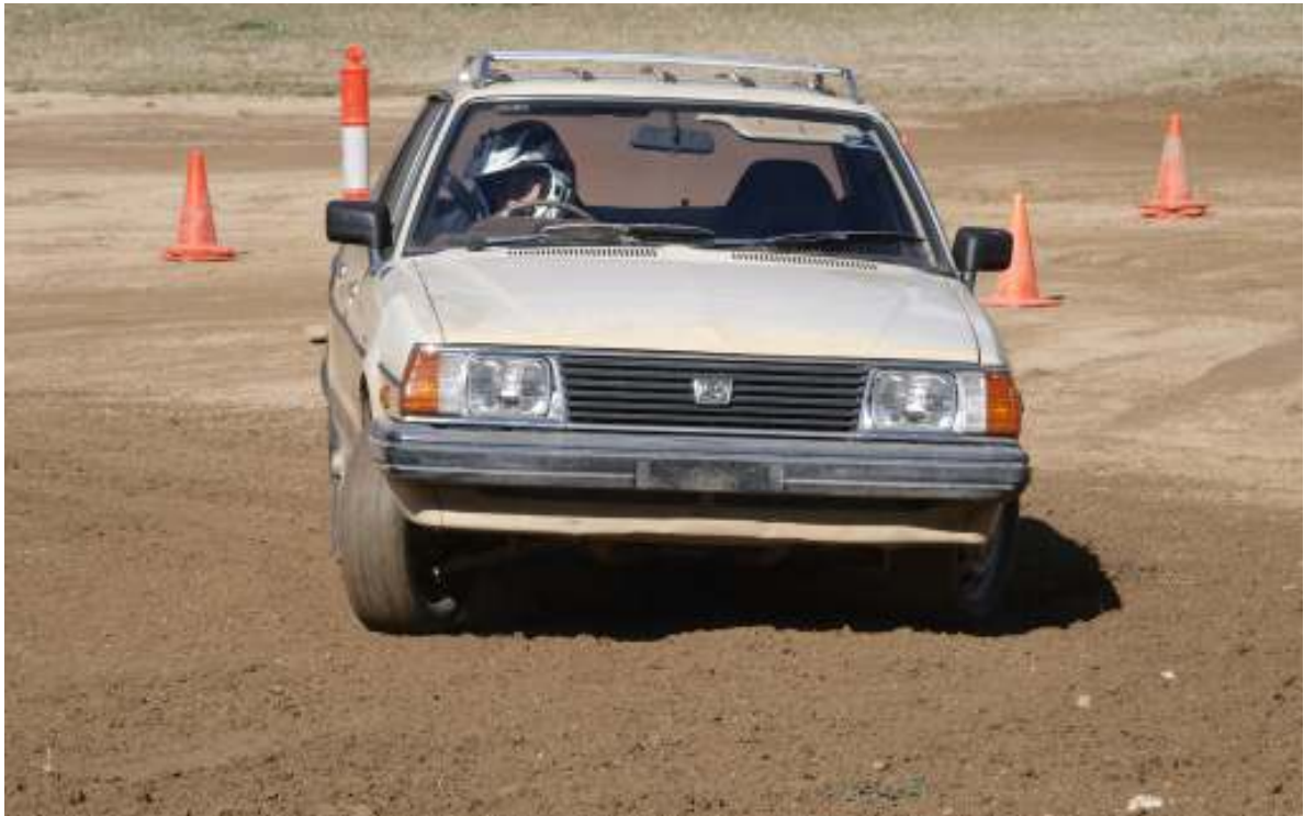
Motorkhana action, part of our 60 years