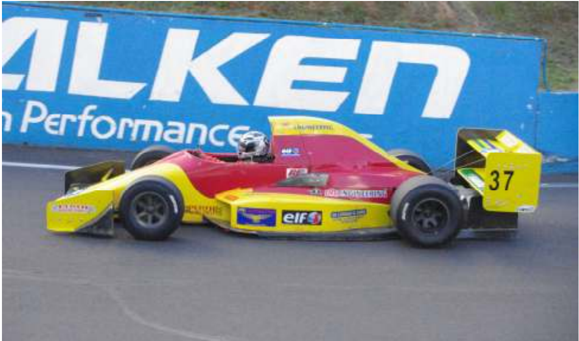
Hillclimbing at The Esses, always part of our 60 years