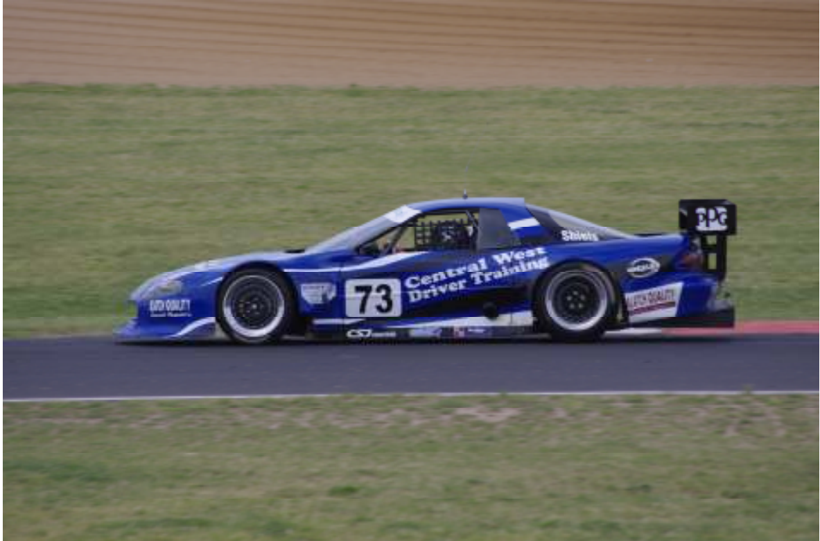
Racing 60 years on and going strong