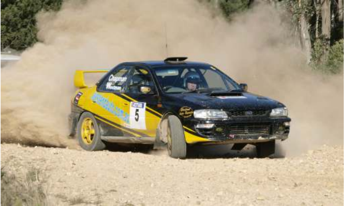
A strong 60 year history