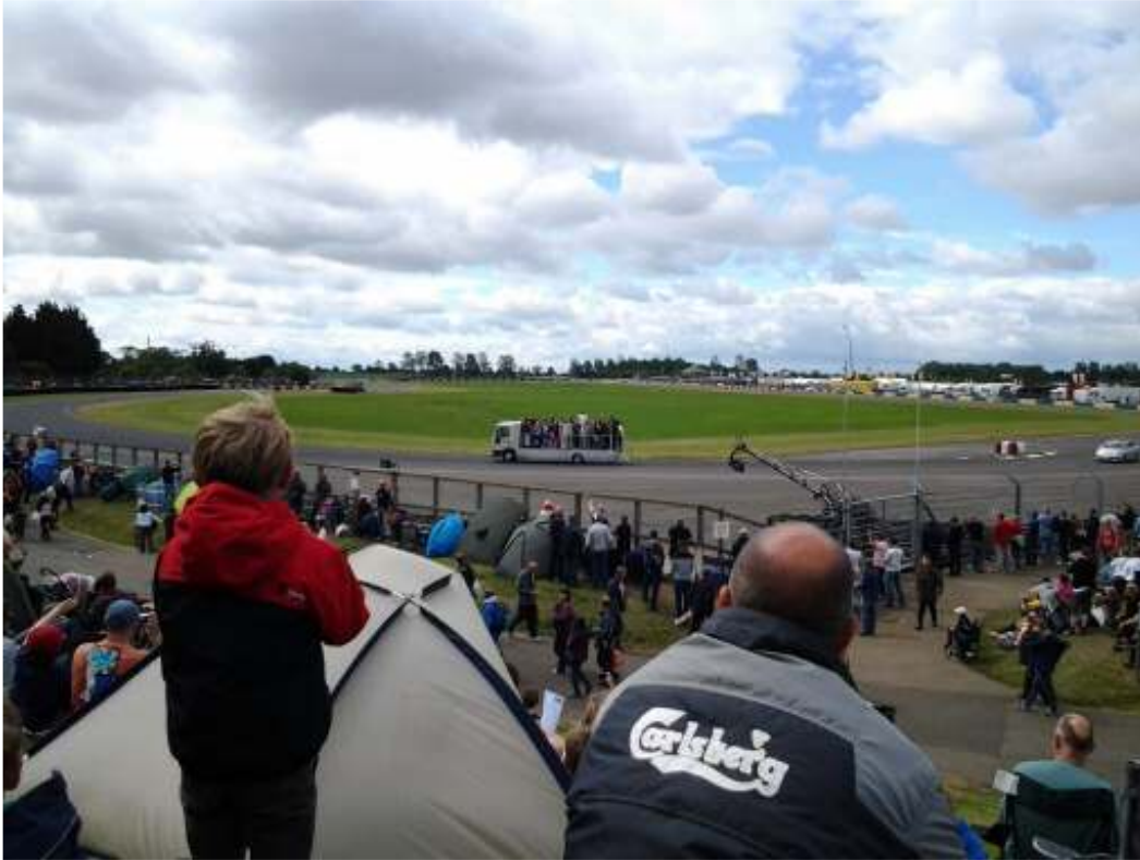
Drivers parade BTCC style- cannot afford the MG Club!