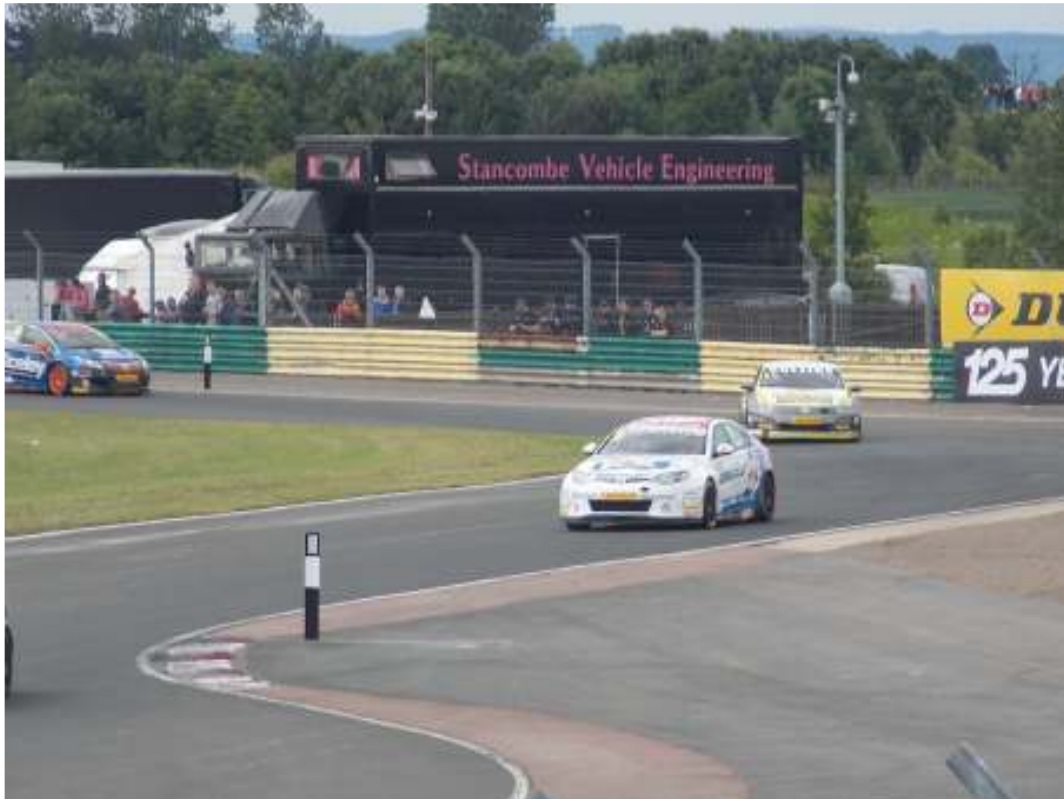
Enjoying English motorsport