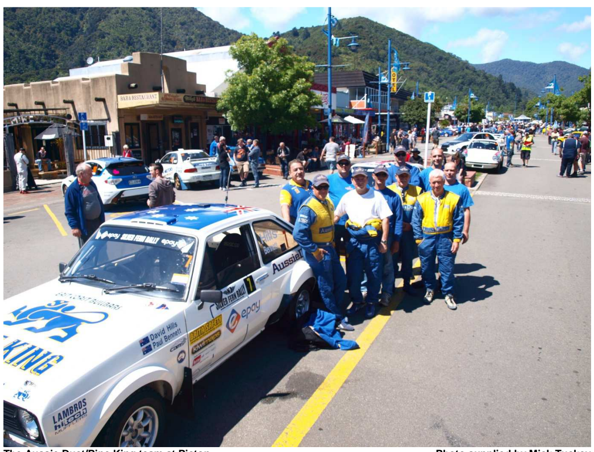
The Aussie Duct/Pipe King team at Picton

This was the fifth time The Aussie Duct/Pipe King team has been across the ditch to participate in this marathon event covering approximately 3500klm all up . The first was on 2006 in the Mk1 Escorts then again in 2008 and 2010 all in the South Island .In 2012 the event shifted to the North Island out of Auckland – this year we were back in the South starting in Picton again in the top of the island and crossing to West Coast before going right to the bottom at Invercargill then back up to finish in Queenstown – 8 days in all.