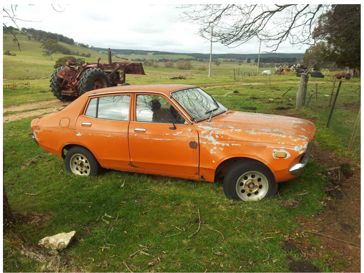
The "General Ree"

James and Belinda are conducting a raffle that will appeal to BLCC members and will be drawn on Fathers' Day September 6<sup>th</sup> 2015. Check out their flyer in The Blower tickets are $5.00 each or 5 for $20.00.