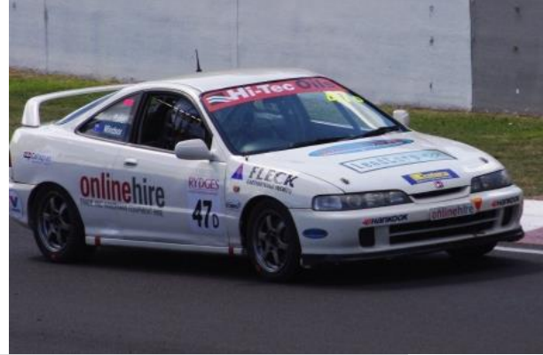
BLCC members at play at the Hi-Tec Oils Bathurst 6 Hour at Easter.