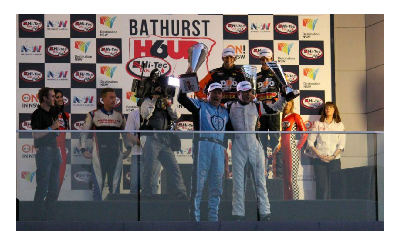
The 2018 Bathurst 6-Hour will take place on Sunday 1 April.