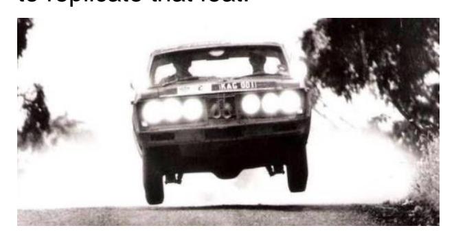
#2 Ford Falcon GT driven by Harry Firth to 8<sup>th</sup>

Back in the day, the first car to finish took an eye-watering 67 hours and 22 minutes non-stop – we will not attempt to replicate that feat.