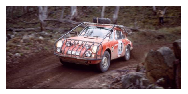
#58 – the Sobieslaw Zasada Porsche 911 S which finished 4<sup>th</sup>

OK, we can't drive from London to Sydney in 2022 but we can do the next best thing – retrace the steps of the game-changing, gruelling Perth to Sydney Australian leg. Original vehicles that will be involved in 2022 are featured.