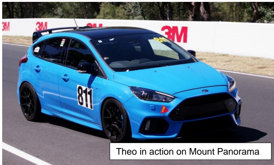
Theo in action on Mount Panorama

With the flood of entries flowing into the Event Secretary, the Club expects the